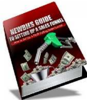
Newbies Guide To Setting Up A Sales Funnel

How to start and build a money making email list of hungry subscribers you can mail out to anytime you want.