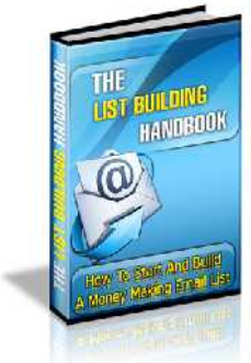
The List Building Handbook

Over 300 powerful tips, tricks and tactics from A-Z to help you build an Internet Empire!