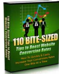
110 Bite-Sized Tips To Boost Website Conversion Rates

Writing killer E-Mails is an essential survival skill in Internet Marketing. If you don't develop the skill, you won't be able to survive. Invest in learning this priceless skill now and guarantee your future success!