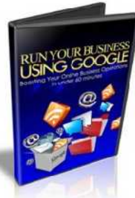
Run Your Business Using Google

Discover The Secrets To Generating More Traffic, Leads, and Sales By Piggy-Backing On High Traffic Social Media Websites. Using These 77 Powerful Tactics, You'll Generate An Unlimited Amount of Traffic To Your Websites!