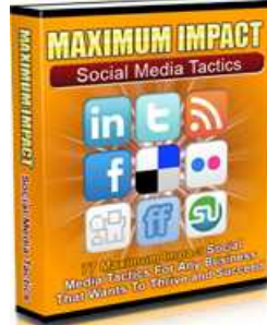
Maximum Impact Social Media Tactics

Shortcut Straight To The Twitter Techniques That Are ESSENTIAL To You As An Internet Marketer, And Leave Out All The Padding And Fluff!